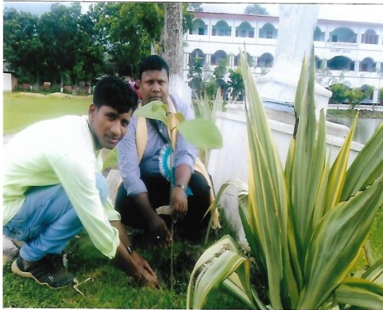
Bon Mahostob to encourage planting trees