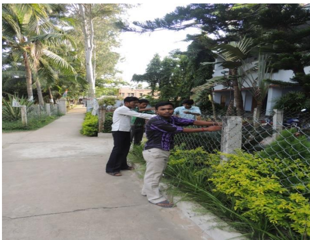
Students taking initiative to protect greenery in campus