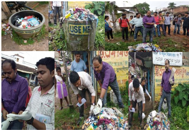
Waste Management Program