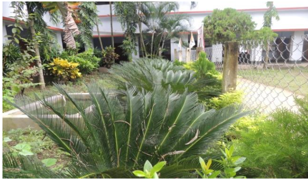
The departmental garden