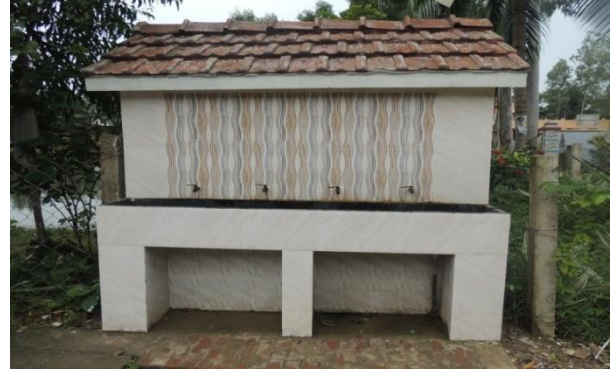
The water tap for students use