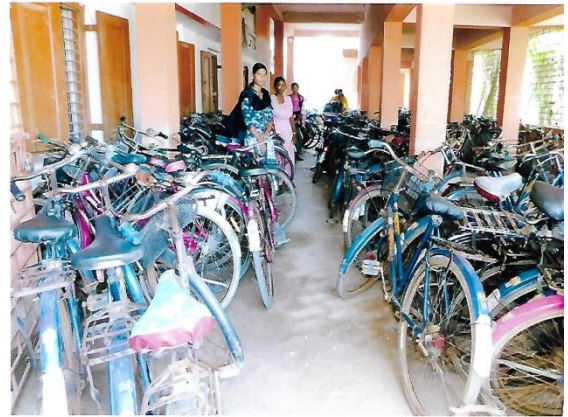
The dependency on bicycle shows less pollution