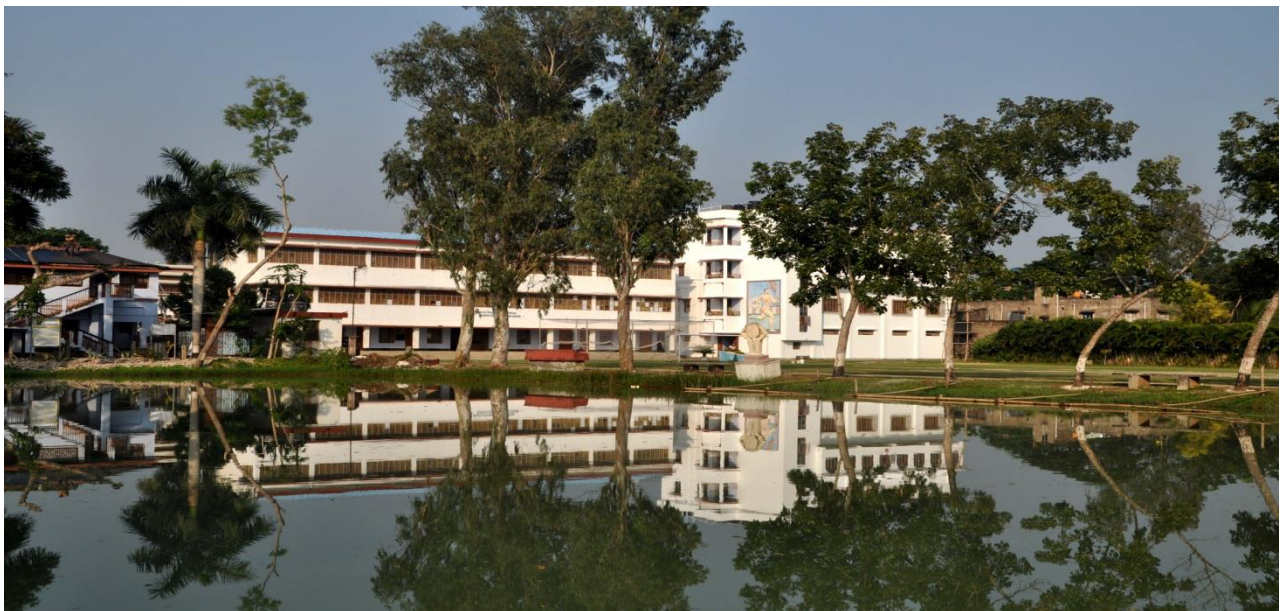
The waterbody that not only adds to the green campus, but also provides a good ecosystem inside the campus