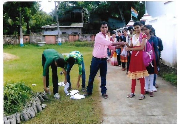
Distribution of plants to students